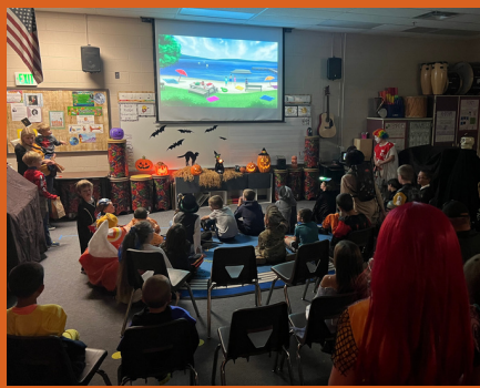
Spooky stories in the music room!!