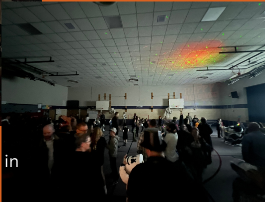
Dance party in the gym!